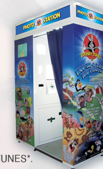
GP LOONEY TUNES*